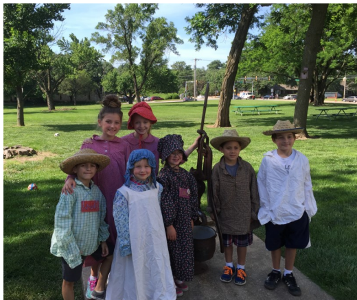
Top Left Campers at our Toys & Games day camp enjoy dressing up in period clothing at the Majors House.