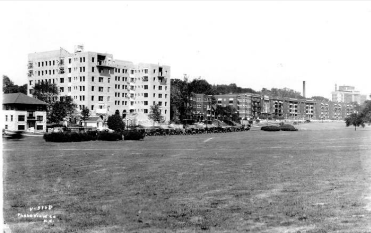
View from Mill Creek Park, 1925, looking northwest from the south end of the park. Shows Parklane apartments under construction and Saint Luke’s Hospital can be seen in the background.

...The greatest change to me has been the turning of the ground, or pasture as we called it, into Park Lane, and all the improvements all along there, the Plaza and St. Luke’s Hospital. Years ago we had to pass by this pasture that fronted on Wornall Road and I often wondered what it could be used for. It had buckbrush, rocks and all kinds of undergrowth. It was just filled with brush and undergrowth, not at all attractive and just look now at the business there. I have seen so many changes. I lived in the Wornall Homestead when it was surrounded by a 500 acre farm, now I live in it surrounded by a city.