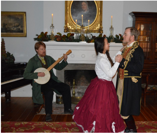
Top Left The Missouri Irish Brigade dances at Candlelight Tours, Dec. 11-12