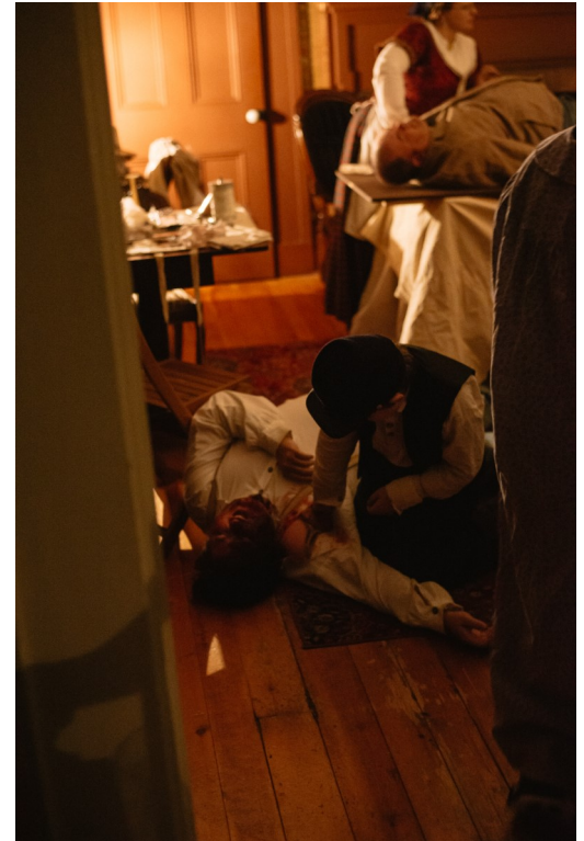
Far Right The Western Bluecoats Field Hospital perform a Civil War surgery demonstration at Ghost Tours, Oct.