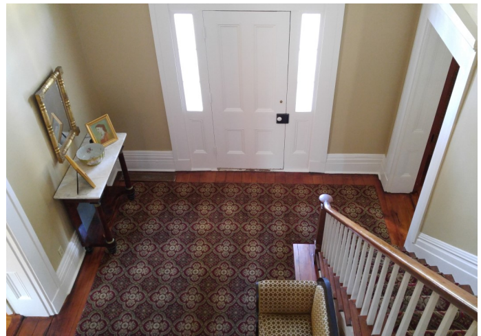
[Below] Foyer after restoration, looking down from landing.