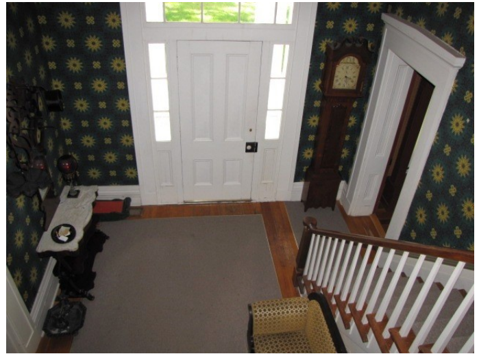
[Above] Wornall House foyer before restoration, looking down from landing.

If you haven’t visited the Wornall House recently, stop by and take a look at the new foyer!