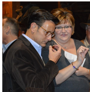
Bottom Left Attendees enjoy a Dark Horse Distillery whiskey tasting at Whiskey Pioneers, Nov.13

T he Wornall/Majors House Museums truly had a banner year in 2015, and our successes are due to your support and involvement. Here is a sampling of some of our accomplishments in 2015: